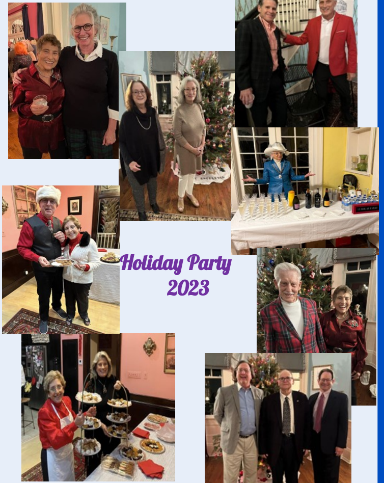
Holiday Party 2023