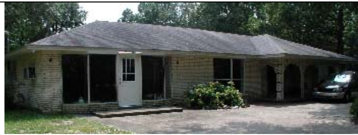
Front view of house from Second Street. Layout of house is below.

Directions from I-10: Take Long Beach/Pass Christian Exit (Beatline Road) to beaches. You'll take a sharp left-turn at the rail road (about 4.5miles). Take 1 st Right turn over train tracks (White Harbor Rd). Take 2 nd right onto Second Street. Go about 1 mile and house is on the left. The number 1558 is on the mailbox.